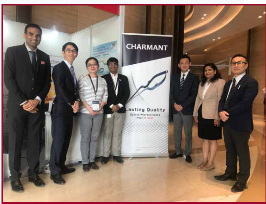
Representatives of Medikabazaar, CBC Group and Charmant at ICCN

The 2 nd International Conference on Complications in Neurosurgery (ICCN) took place at the JW Marriot, Andheri, from 25 th -27 th January 2019. The prestigious event brought together esteemed neurosurgeons from India and around the world for engaging discussions on the various social, geographical, cultural, and economical issues affecting the neurosurgical practice.