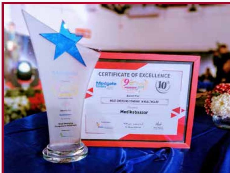
The trifecta trophy for "Most Emerging Company in Healthcare"

A moment of great significance for Medikabazaar as we won the "Most Emerging Company in Healthcare" at the 9 th MT India Healthcare Awards 2019. With this award, we complete a trifecta of accolades at this particular event. In 2017 we were recognized as the "Healthcare IT Company of the Year" after which we bagged two consecutive "Most Emerging Healthcare Company in Healthcare" in 2018 and 2019.