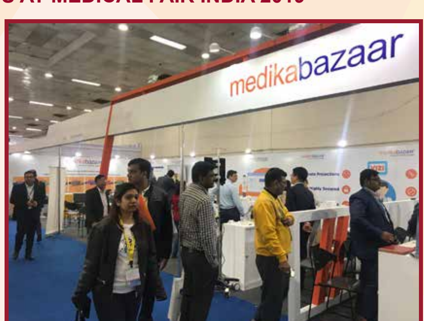
Medikabazaar's 1200 sq.ft. pavilion at Medical Fair India 2019

Being a member ourselves, it was an exciting moment as we were the Innovation Partners for Medical Fair India 2019, New Delhi, one of the largest medical events in the country organized by MedicaAlliance, a German conglomerate which coordinates such events all over the world.