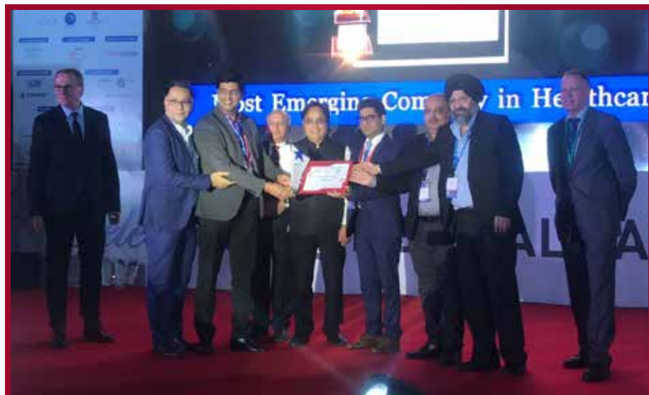
The Medikabazaar team receiving the accolade