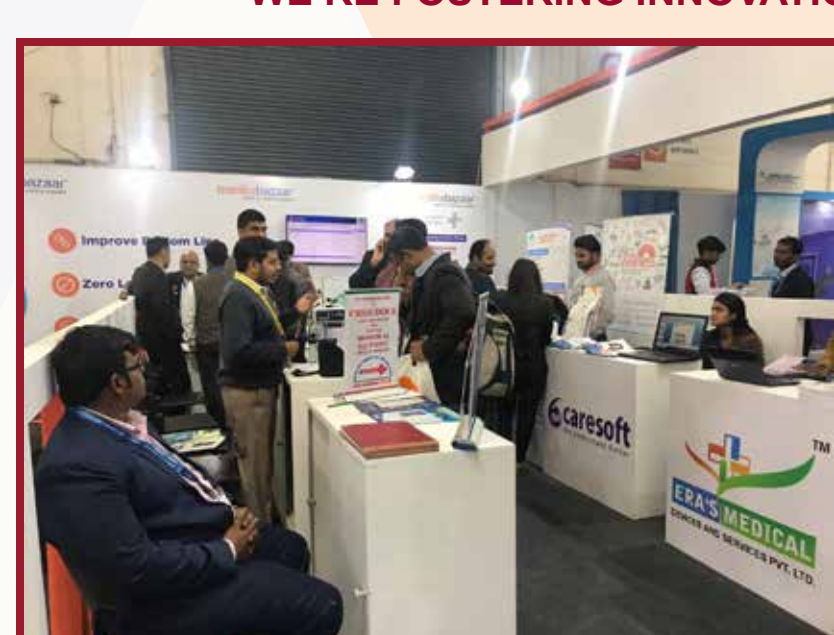
Upcoming startups showcasing their innovations at the Medikabazaar pavilion